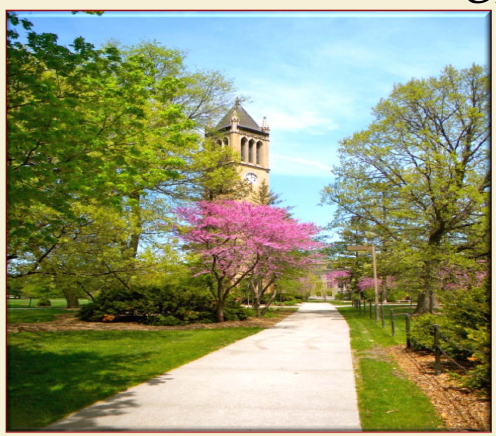
FY2014 Operating Budget